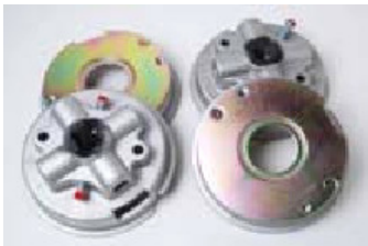
NS3002 SPRING FITTING 6" S SINGLE THREAD - SET OF 4