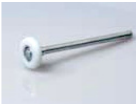
NS4001 ROLLER 2-7-11 N for 2" TRACK - 7" STEM WHITE NYLON (METRE)