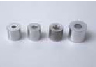
NS5041 ALUMINIUM OVAL CABLE SLEEVE 3MM NS5042 ALUMINIUM OVAL CABLE SLEEVE 4MM NS5043 ALUMINIUM OVAL CABLE SLEEVE 5MM