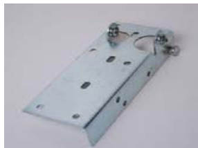
NS2002 COMMERCIAL BOTTOM BRK FOR 2" TRACK (11MM STEEL ROLLERS) PAIR