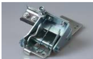
NS2003 2" SAFETY BOTTOM BRACKET FOR 2" TRACK - PAIR