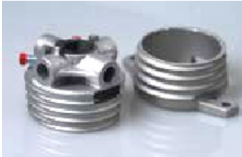
NS3001 SPRING FITTINGS 3 3/4" U UNIVERSAL THREAD - PAIRS