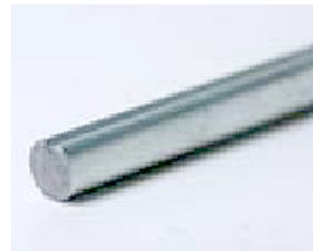
NS5001 SOLID STEEL SHAFT 1" DIA X 6 MTR LONG WITH 1/4" KEYWAY (MTR) NS5002 SOLID STEEL SHAFT 1" DIA X 3 MTR LONG WITH 1/4" KEYWAY (MTR)