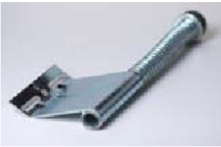
NS5021 PUSHER SPRING 15" (6" COMP) BKT WITH MOUNTING SLOTS - PAIR