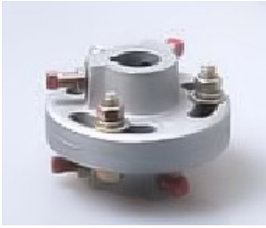
NS5011 SHAFT COUPLER 1" BORE WITH 1/4" KEYWAY MALLEABLE IRON