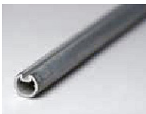
NS5003 TUBULAR STEEL SHAFT 1" DIA X 6 MTR LONG WITH 1/4" KEYWAY (MTR) NS5004 TUBULAR STEEL SHAFT 1" DIA X 3 MTR LONG WITH 1/4" KEYWAY (MTR)