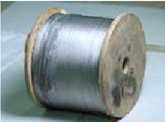
NS5031 CABLE 7 X 7 3MM (METRE) NS5032 CABLE 7 X 7 4MM (METRE) NS5033 CABLE 7 X 7 5MM (METRE) NS5034 CABLE 7 X 19 3MM (METRE) NS5035 CABLE 7 X 19 4MM (METRE) NS5036 CABLE 7 X 19 5MM (METRE)