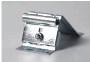
NS2001 RESIDENTIAL BRACKET 62MM X 60MM X 95MM (11MM STEEL ROLLERS)