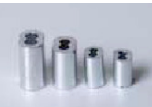
NS5051 ALUMINIUM OVAL CABLE SLEEVE DOUBLE 3MM NS5052 ALUMINIUM OVAL CABLE SLEEVE DOUBLE 4MM NS5053 ALUMINIUM OVAL CABLE SLEEVE DOUBLE 5MM