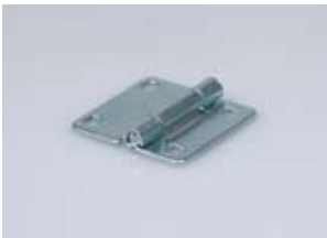
NS1002 HINGE 2.5MM X 65MM